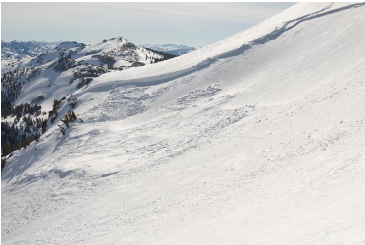
of a portion of a very large avalanche on the northeast face of Elephants Back in the Carson Pass area.

Dues are $25 annually with membership subject to approval by the Board of Directors.