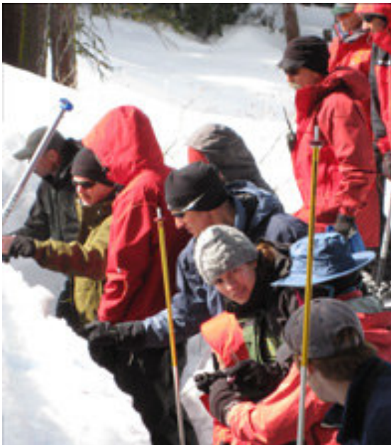
The group learns to look for buried clues about avalanche danger in the snowpack