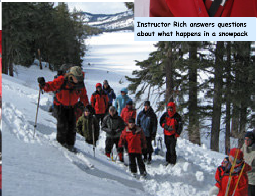
The group learns about snowpack stability tests such as the Ruschblock and how they relate to "red light, yellow light, green light" decisions about snowpack stability