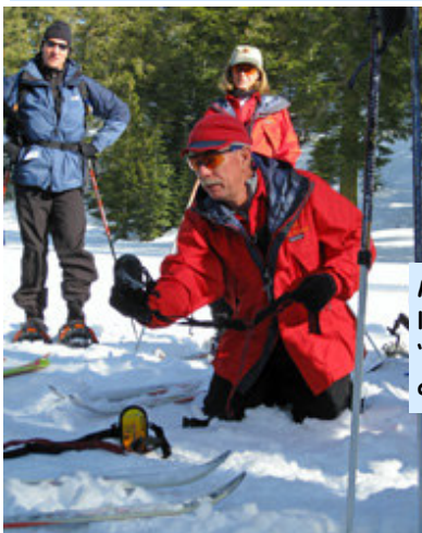
Monte illustrates flux lines and the final "pinpoint" stage of an avalanche beacon search

Teams work together on an avalanche rescue scenario. Here the beacon searcher hones in on a buried signal and calls for probes to find the "victim" and determine depth of burial. All the teams did great and learned the value of practice, practice, practice!